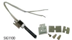
SIG1100 $19.99 _____ Universal Round Furnace Igniter Kit Replaces over 170 igniters