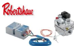
Robertshaw. 712-017 $154.64 _____ • 1/2" X 3/4" Combo Gas Valve • 780-715 Non-lockout Ignition • Natural Gas 200,000 BtuH Capacity