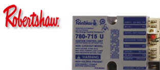
Robertshaw. 780-715 $97.17 _____ Non-lock Ignition Control