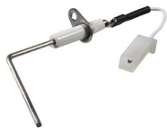
PFS014 $12.09 _____ Carrier Flame Sensor