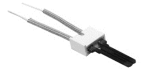
41-402 _____ 19" Leads