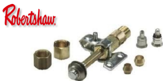
Robertshaw. 1800-100 $33.25 _____ Universal 9b Pilot Uni Kit.