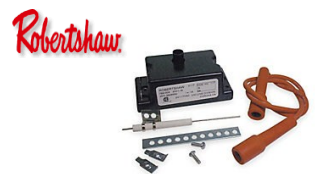
Robertshaw. 785-001 $45.46 _____ Auto Pilot Relighter Kit