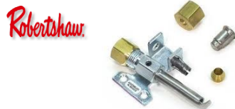
Robertshaw. 1810-100 $20.49 _____ Universal 2b/c Pilot Uni kit