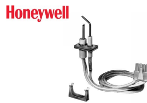
Q3400A1024 $56.62 _____ 30" Igniter Flame Rod Assy.