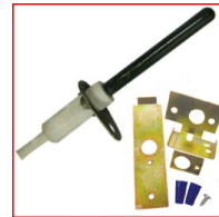
68040 $19.99 _____ Nitride Design Replaces Silicone Carbide Igniters 3 Year Warranty